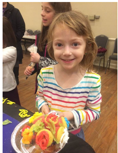
Kids Chef Class